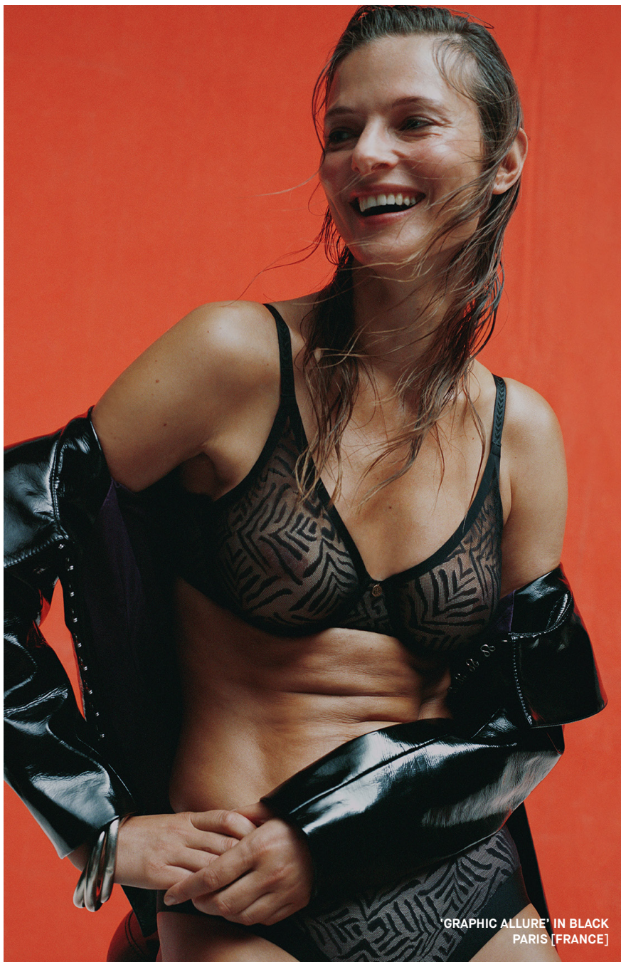
'GRAPHIC ALLURE' IN BLACK PARIS [FRANCE]