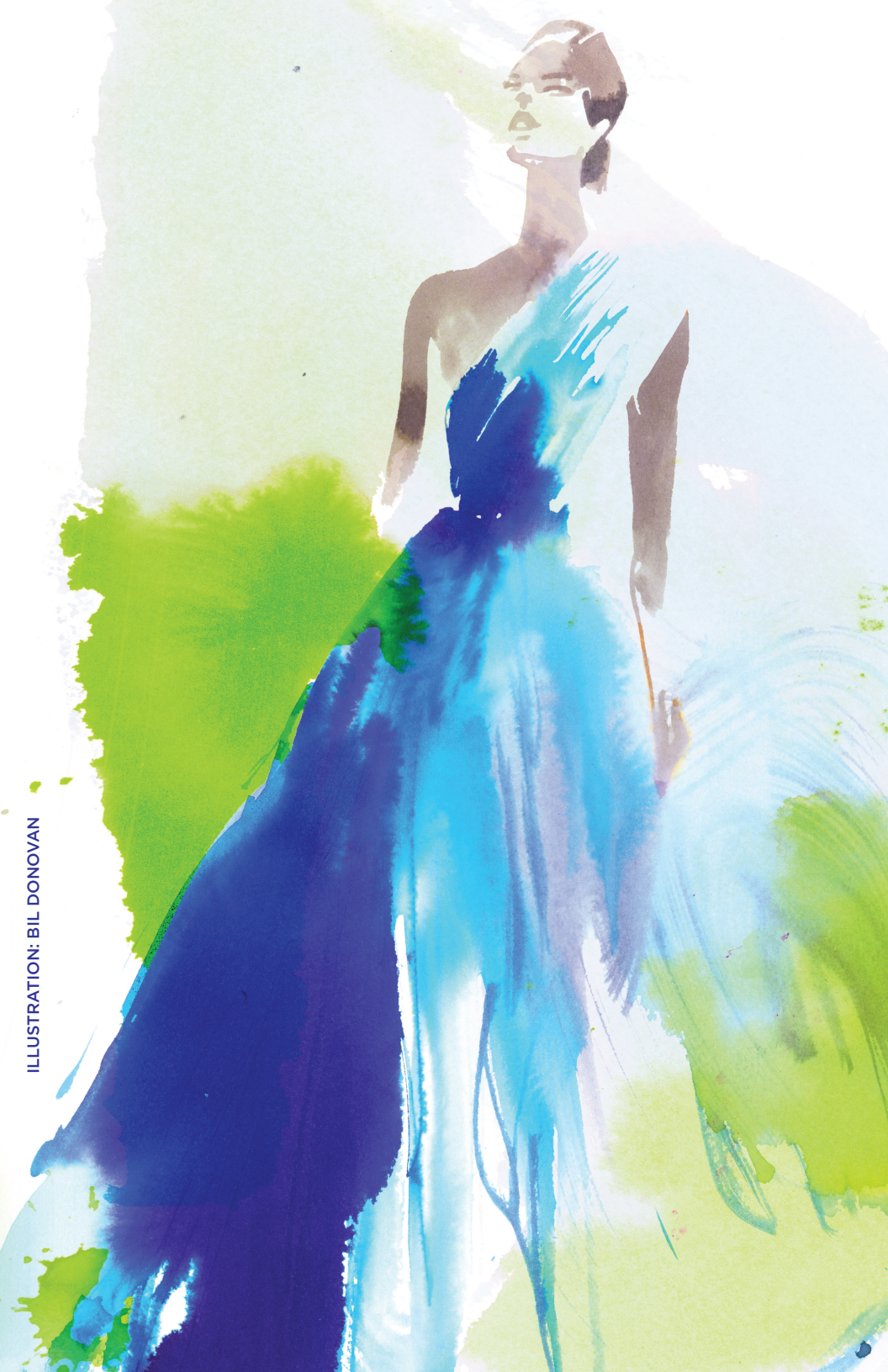
ILLUSTRATION: BIL DONOVAN