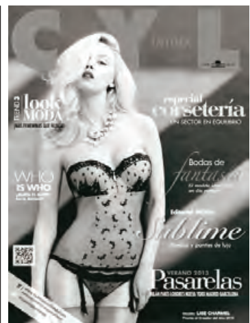
Spain & Portugal