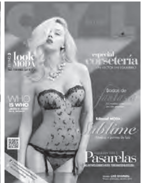
Spain & Portugal